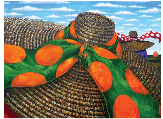
Jonathan Green Uncle Harry's Farm Bus 18" X 24"